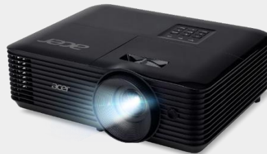
4,500 Lumens SVGA Projector X1128HK