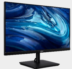
24" ZeroFrame FHD Monitor V7 series